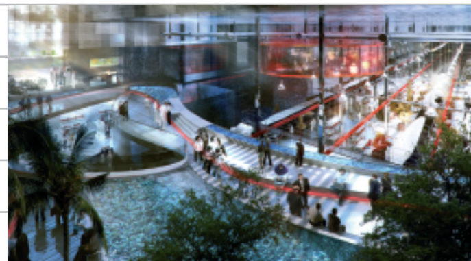
City of the future An artist's impression of the brand new Masdar City

GIS is a technology designed to meet these needs. It provides the geographical context for all manner of different data sets to be compared and examined, enabling potential impacts to be modelled for more sustainable, transparent decision-making.